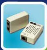
C10245M ADSL IN-LINE