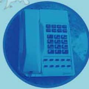
Wall phone solution filter easily mounted on the wall plates for phone to be refixed to