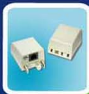
C10645M ADSL 600 SERIES