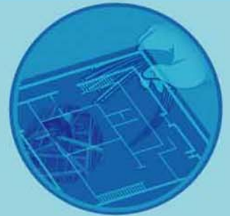
Complete solution for recabling & can be installed only by trained installer