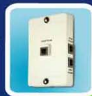
C10345M ADSL WALL PHONE