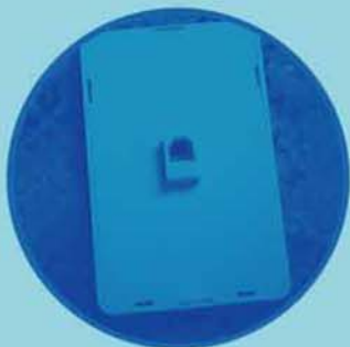
Modular wall socket solution