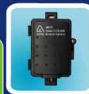
C10100E ADSL CENTRAL (Remote Splitter)

This product range is Telstra Approved & Certified to both Telstra RCIT.0004 and AS/ACIF S041:2005