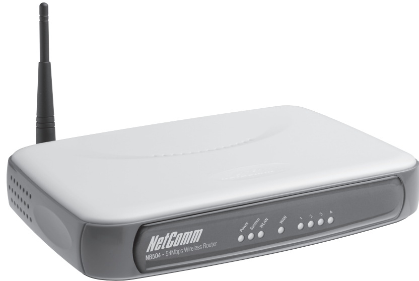
NB504 54Mbps Wireless Router