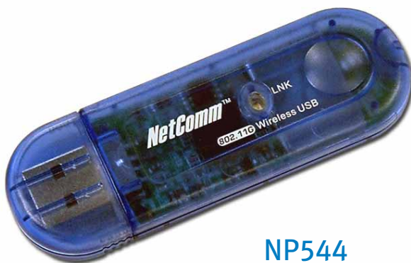
NP544 (actual size)