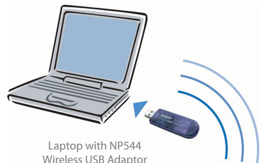
Laptop with NP544 Wireless USB Adaptor

Installation and setup is also quick and simple. Just plug the NP544 into any USB 2.0 port on your PC or Laptop, run the setup Wizard and you are ready to get wirelessly connected with the minimum of fuss.